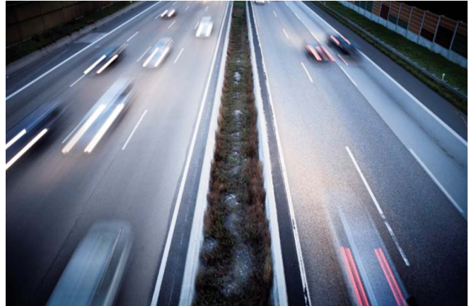
3x speed with 802.11ac

The 3X speed improvement achieved by the new standard means that the 450 Mbps performance from today's fastest 3 antenna 802.11n device can be achieved by single antenna 802.11ac device – with similar power consumption. This means that a typical tablet with single antenna 802.11n 150Mbps WiFi can now support 433 Mbps with 802.11ac – without any increase in power consumption or decrease in battery life.