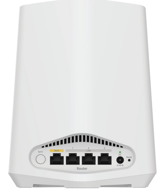
Orbi Pro WiFi 6 Mini Router (SXR30)