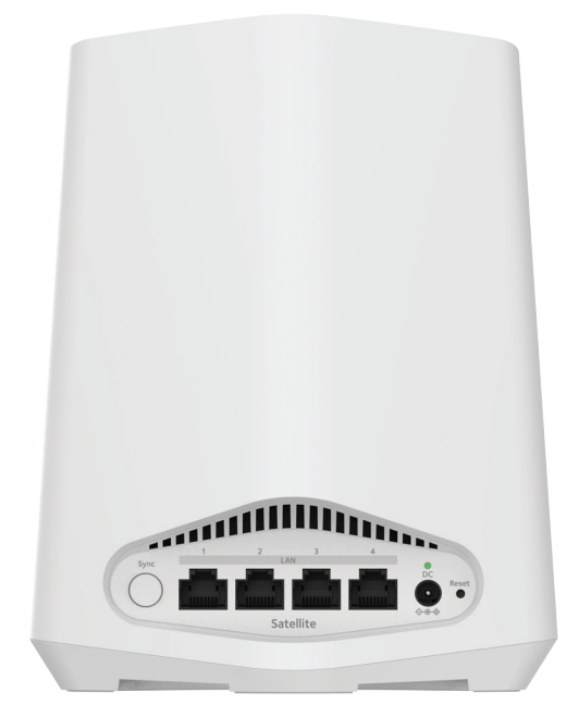
Orbi Pro WiFi 6 Mini Satellite (SXS30)