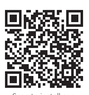
Scan to install app