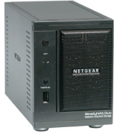
Convenient, small size for desktop use (~ 6 x 4 x 9 in)